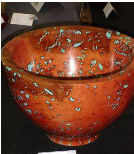
◀ This striking bowl from Gert Ferreira is from Red-river Gum burl with turquoise inlays.

If you wanted to try out the Black Line PCD ► insert tools, staff members from Circumference were ready to show you how to start with them.